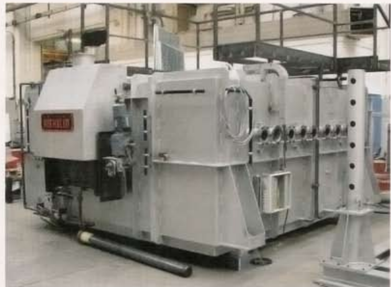
建造中的转底炉 A New Rotary Hearth Furnace is in Building